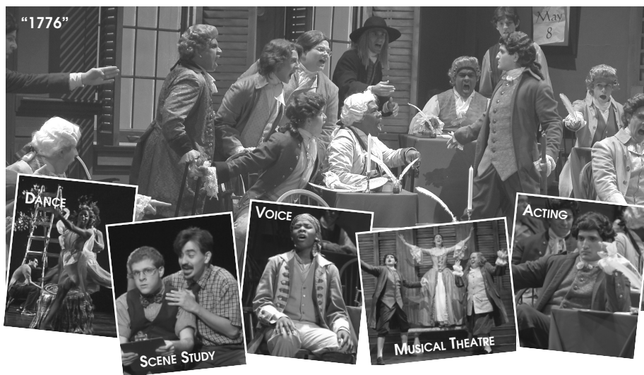
Photos (above and cover) by Warren Westura of NJYT's 2009 production of Sweeney Todd at NJPAC